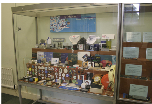
"Trash & Trinkets"

With HLG19 now open, we are preparing HLG14, the room opposite, as a new display area. We are hoping to use the displays from the Galileo Centre around the walls, and have populated two cabinets so far, one with PC / PS2 adapter cards, the other with "Trash & Trinkets" - it's amazing how many give-aways and awards IBM has produced over the years. The cabinet is brim full, and we still have lots more!